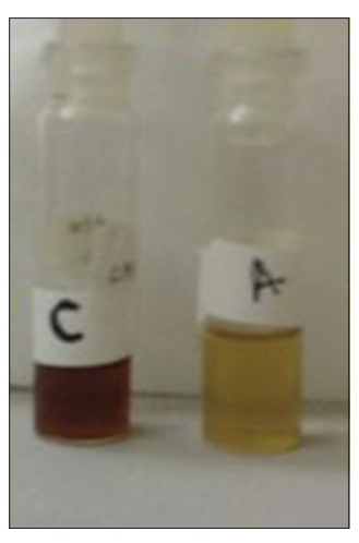
Figure 2: Authentic in-house (A) and commercial (C) mother tincture

we could infer that the commercial differs substantially from the authentic sample [Figure 2]. However, the origin of this disparity could not be ascertained without further study.